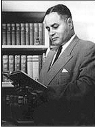
Ralph J. Bunche, PhD